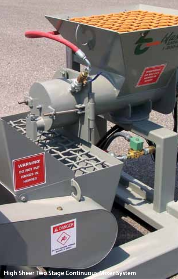
High Shear Two Stage Continuous Mixer System