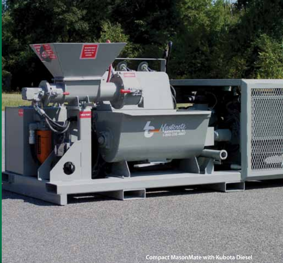
Compact MasonMate with Kubota Diesel